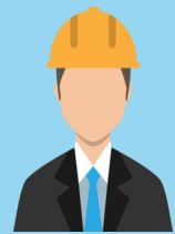
Terry's Classic Construction